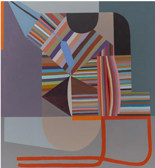
Top image: Stas Orlovski, Head with Statues , ink, acrylic, xerox transfer and collage on paper, 15" x 11"

See our News & Events page for more information.