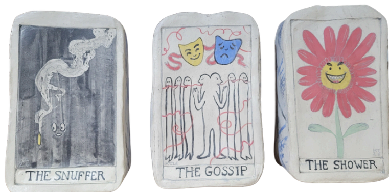
The Shower / The Grower