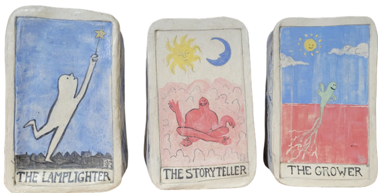
The Snuffer / The Lamplighter